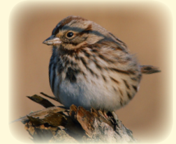
- Luke 12:6-7

More info: RSVP by 2/13/15 to stevedarro@aol.com . Not available for CEUs. A free will offering will be taken.