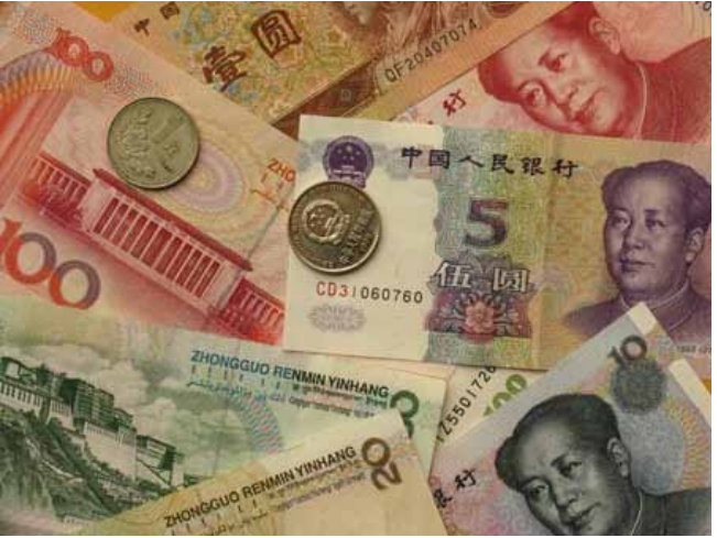
"Money reigns supreme in China, and the people are aligning themselves after it."

There were about twenty students in the school. Almost all of them were in their early twenties. They have a vigorous daily routine. They get up at 5:00 a.m. for prayer, devotions, and various chores. They have 6 classes, 50 minutes each, everyday, which pretty much takes up all morning and afternoon. They also have to hand-wash their own clothes, cook, clean, and do homework. For security reasons, they can only have one half day of free time outside the campus every month. They can only call home once a week and go home once a year.