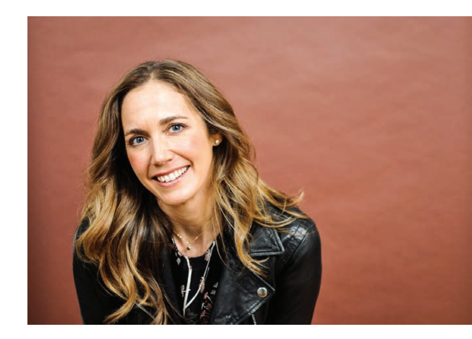
Current City: Lake Oswego, Oregon Degree: MA (Biblical and Theological Studies)

For two years, Roberts participated in a cohort training model at Western's Portland campus, where she was able to connect with other thought leaders and pastors