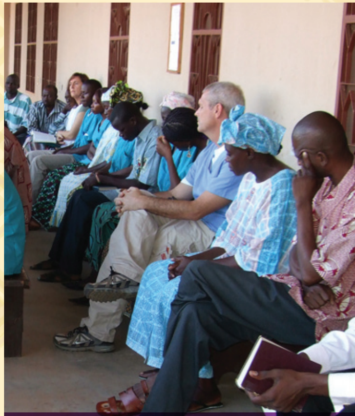
The hospital staff gathers for daily morning devotions.