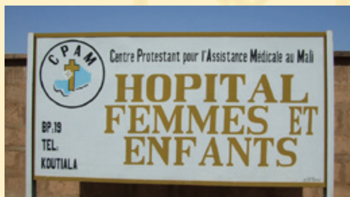
Sign for the hospital in French.