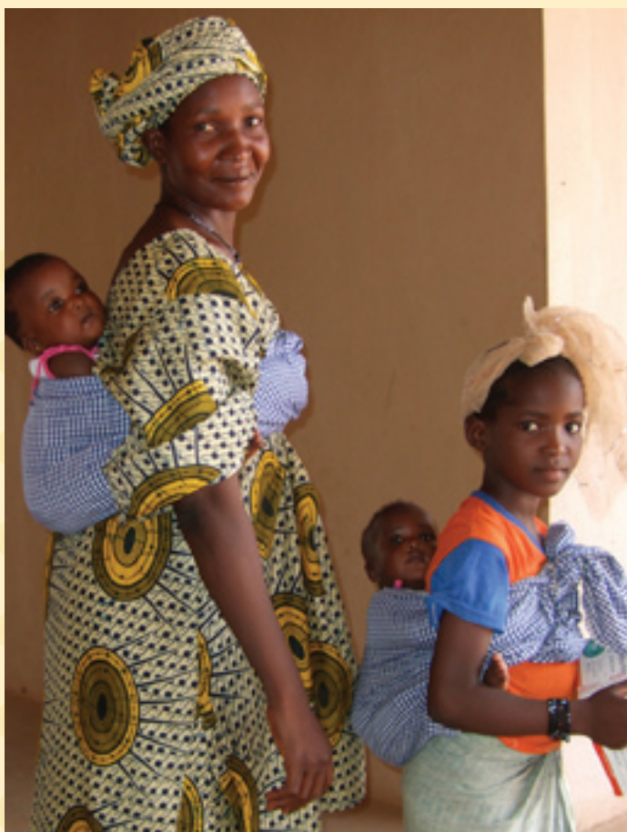
Twins carried home by their mother and big sister.