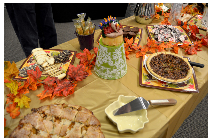
A group of 50 (including students, staff and faculty) gathered in the evening on November 17 for the HarvestFest Student Social, which was hosted by Western staff. We enjoyed hot apple cider, hot chocolate, pumpkin spice chai, pumpkin log, pumpkin pie, pecan pie, apple pie, Peppermint Bark, brownie bites, ice cream, and cookies...oh my! This made for a lively time of fellowship! Stay tuned for our next Student Social...