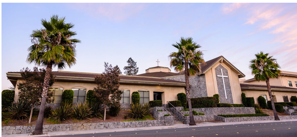
Western Seminary's new home at Christ Community Church in Milpitas.